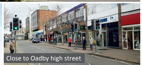
Close to Oadby high street