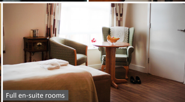
Full en-suite rooms