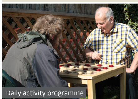
Daily activity programme