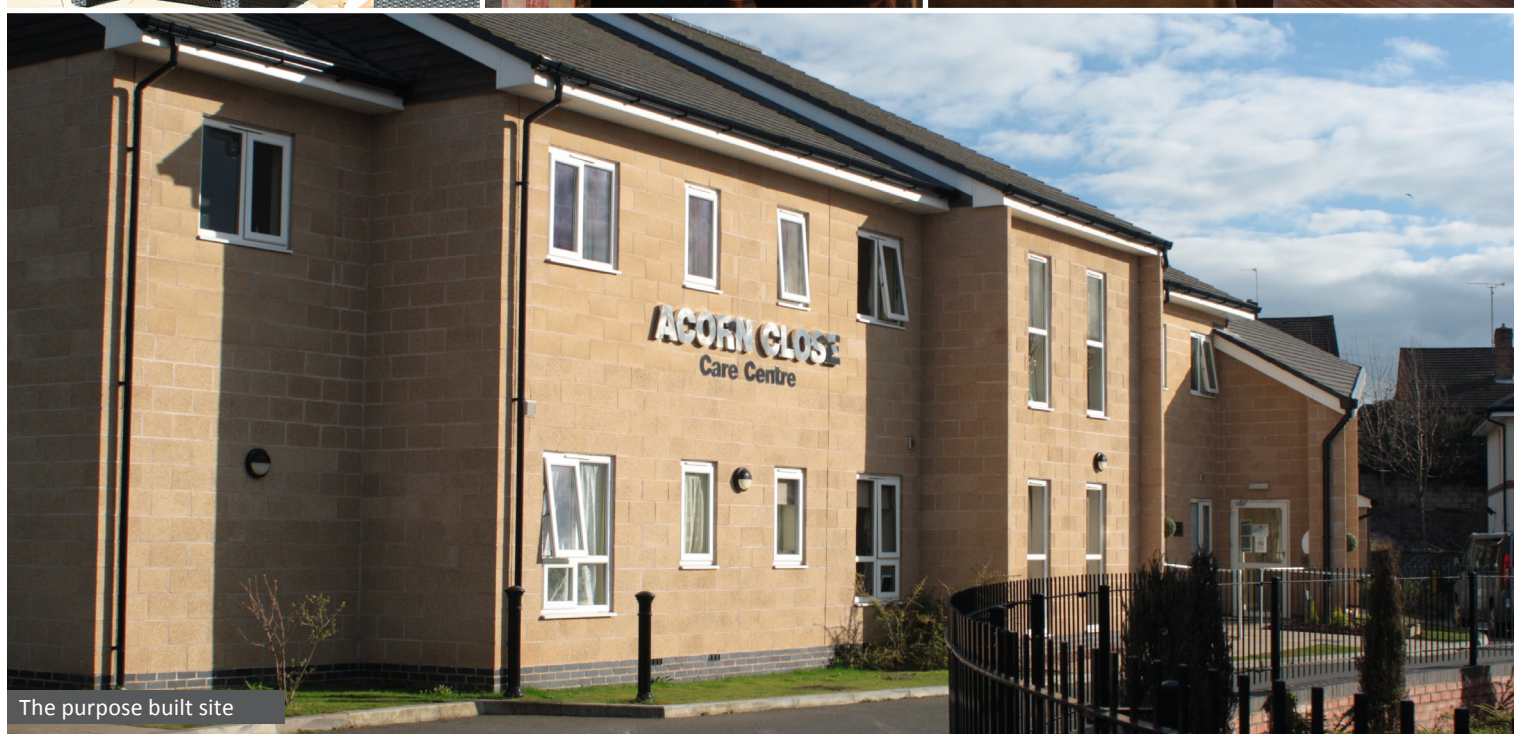
The purpose built site