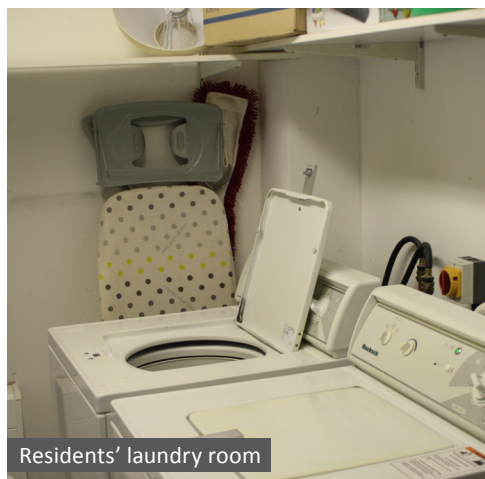
Residents' laundry room

Acorn Close is a 23 bed care centre with all single en-suite accommodation, providing for clients whose needs are associated with their mental health, together with a provision for clients with physical and learning disabilities.