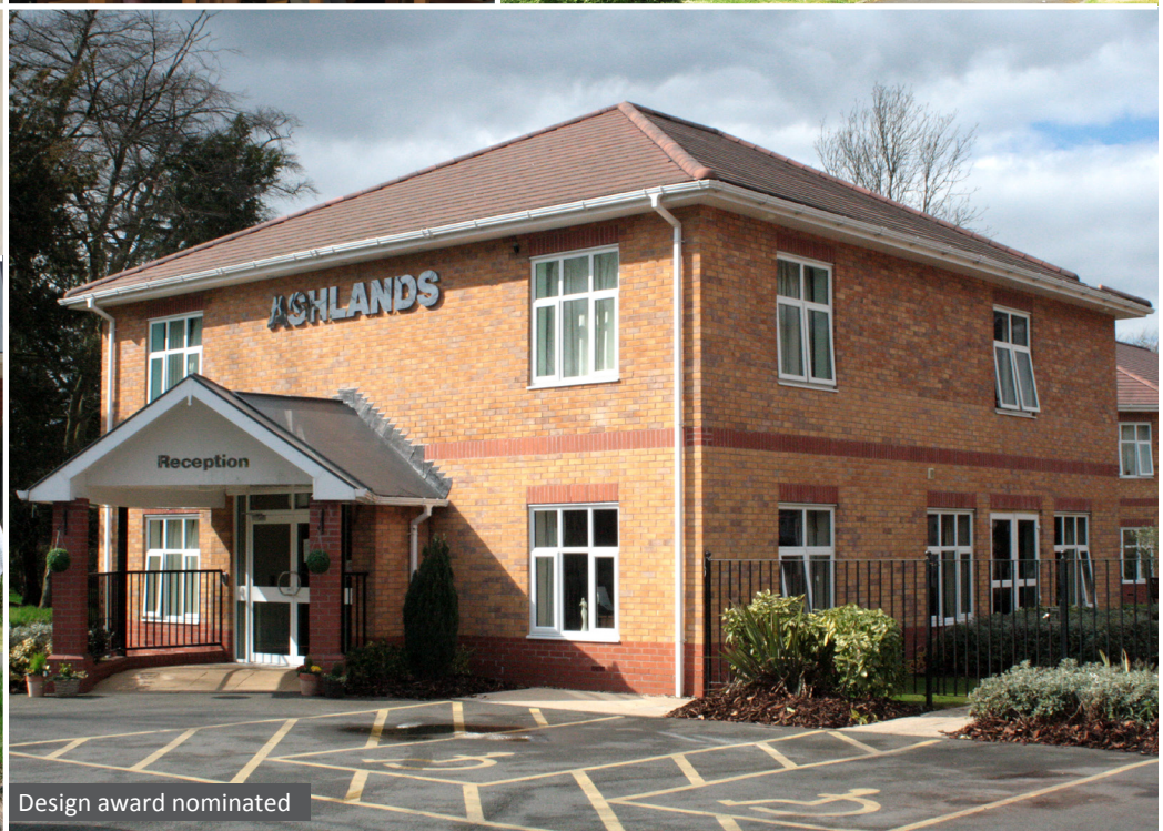
Design award nominated