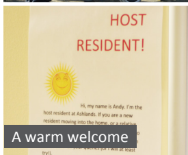
A warm welcome