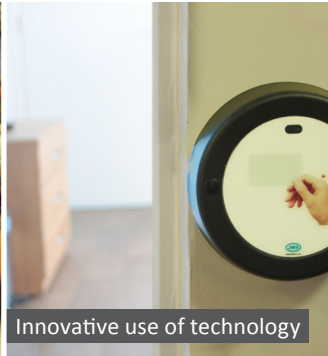
Innovative use of technology