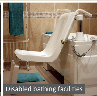
Disabled bathing facilities