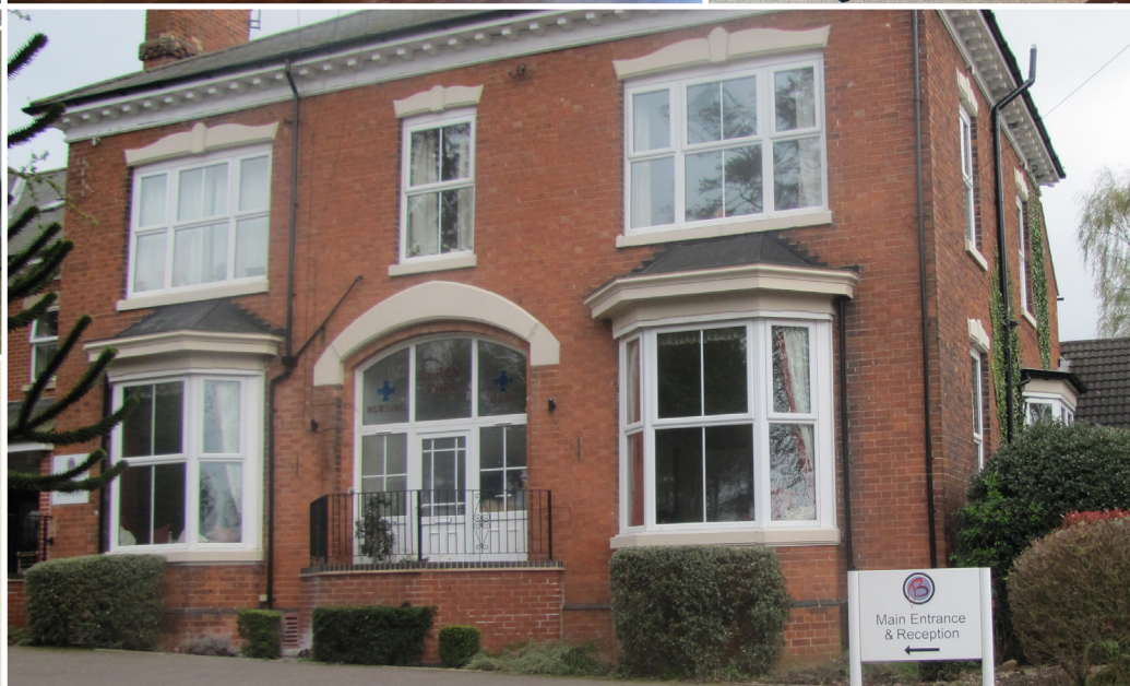
Main Entrance & Reception