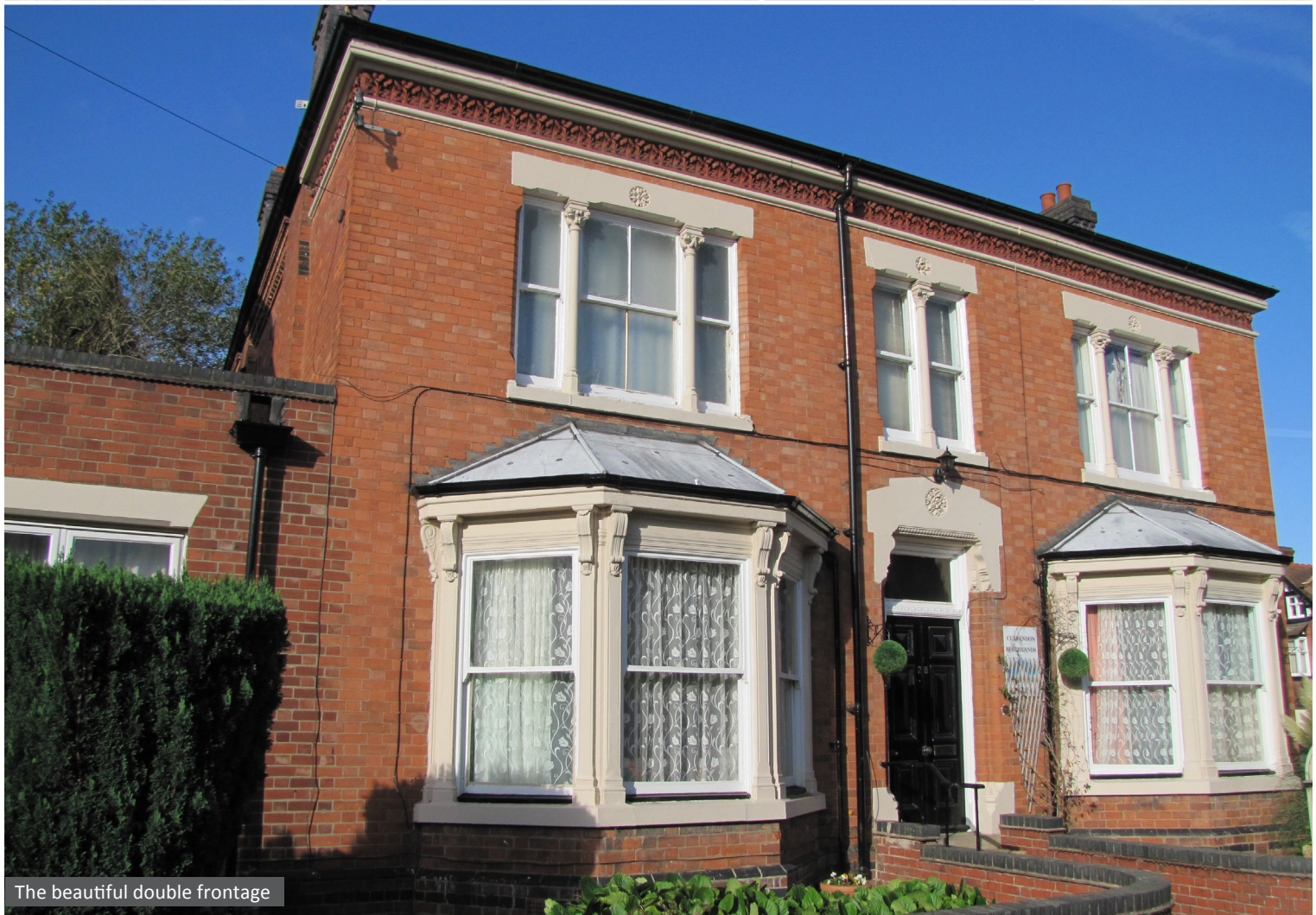
The beautiful double frontage

28 Central Avenue, Clarendon Park, Leicester, Leicestershire LE2 1TB | 0116 2703968