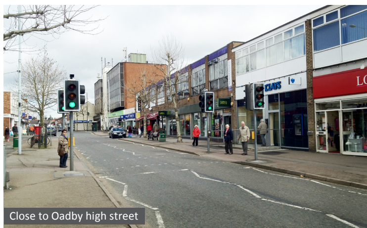
Close to Oadby high street

Brockshill Woodlands Cottages are located close to the centre of Oadby and adjacent to our care home by the same name, giving good access to shops and local amenities.