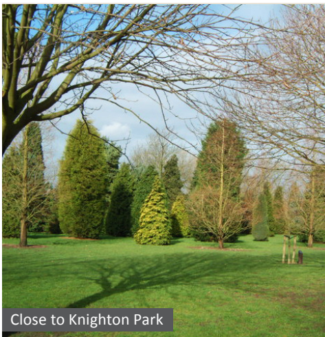
Close to Knighton Park