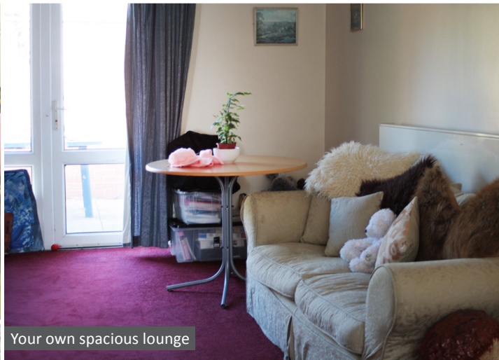
Your own spacious lounge