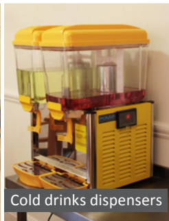
Cold drinks dispensers