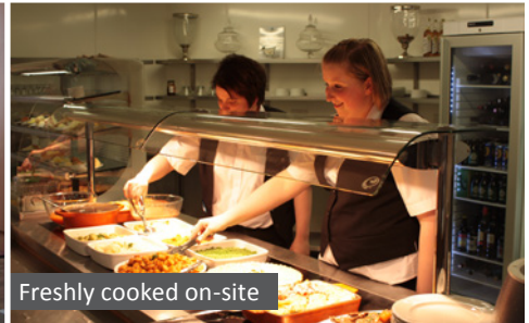
Freshly cooked on-site