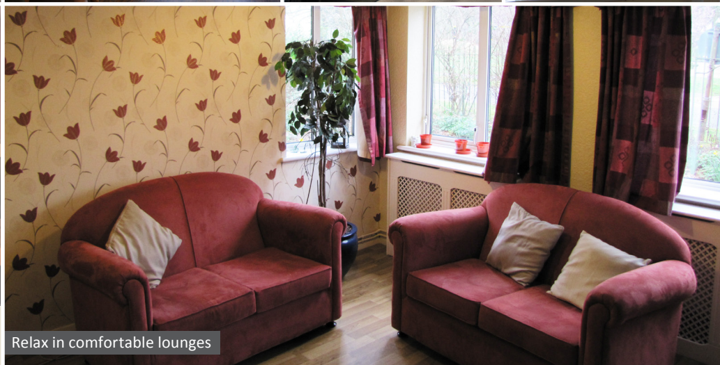
Relax in comfortable lounges