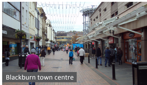
Blackburn town centre

Hawkhurst is a 26 bed care centre providing for client's whose needs are associated with their mental health, including dementia.