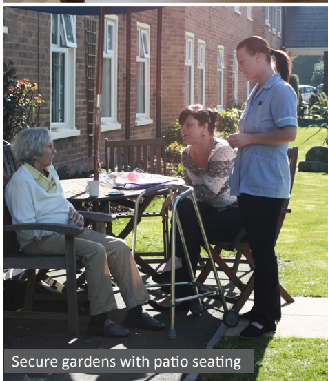
Secure gardens with patio seating