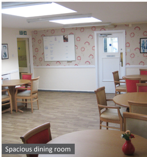
Spacious dining room