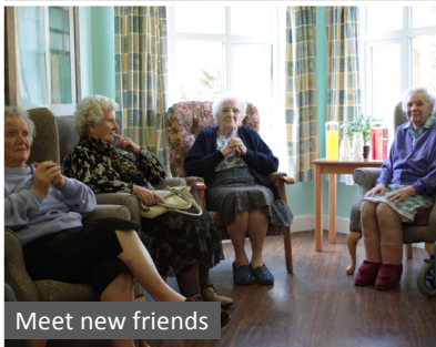
Meet new friends