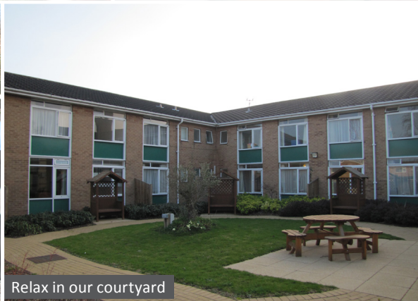
Relax in our courtyard