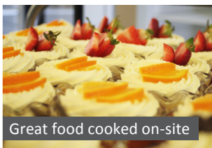
Great food cooked on-site