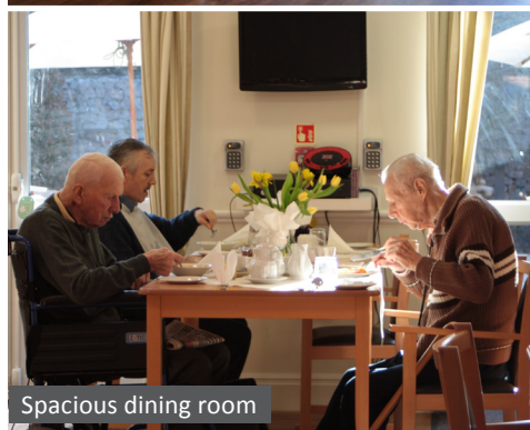
Spacious dining room