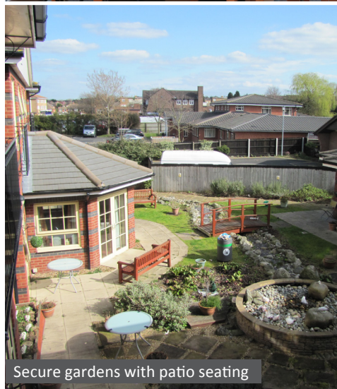
Secure gardens with patio seating