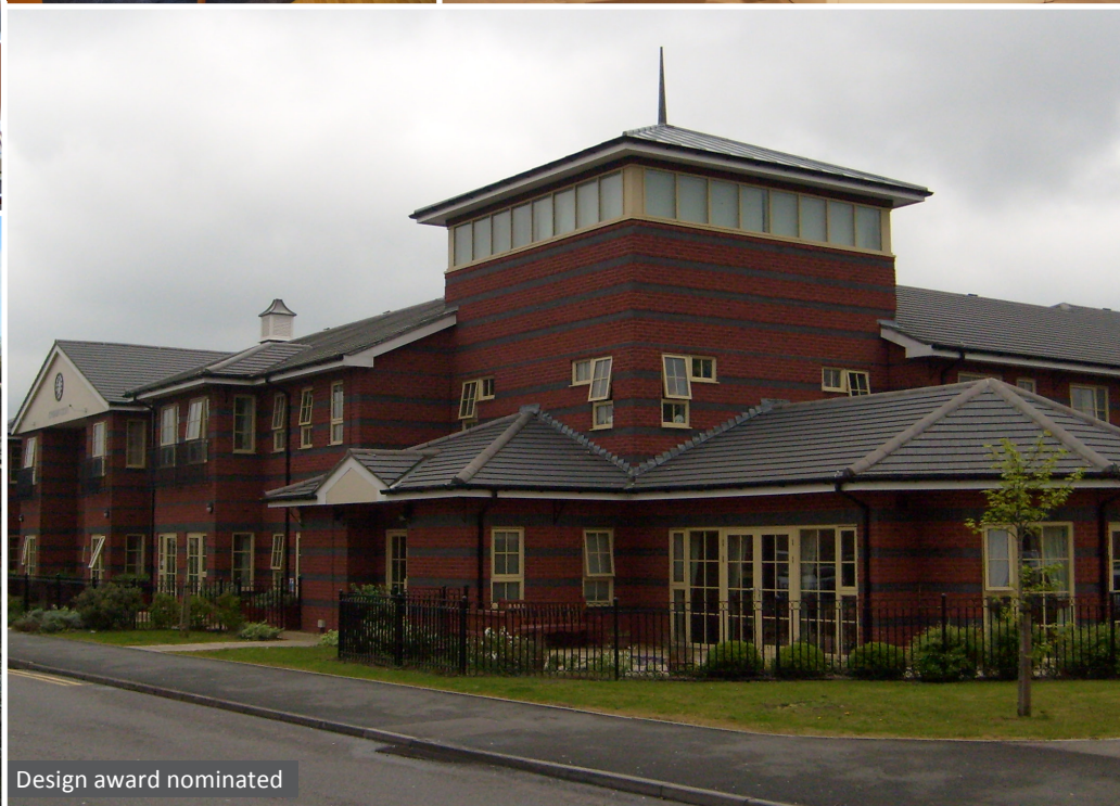
Design award nominated