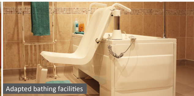
Adapted bathing facilities