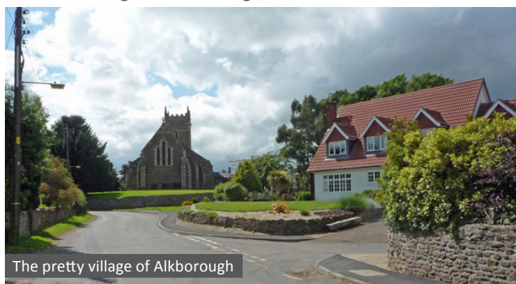
The pretty village of Alkborough

Manor House is located just a short walk from the centre of the village of Alkborough, in North Lincolnshire.