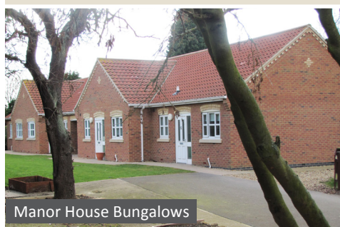
Manor House Bungalows