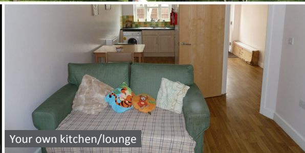
Your own kitchen/lounge