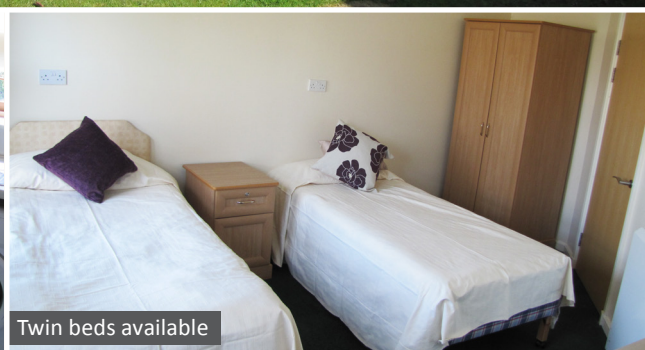
Twin beds available