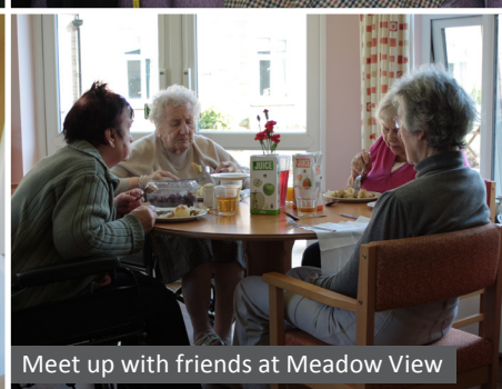
Meet up with friends at Meadow View