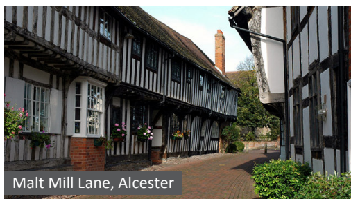
Malt Mill Lane, Alcester

Meadow View Cottages are based within the grounds of our purpose built, 43 bed care centre, for clients whose needs are associated with old age and frailty. Offering six one bedroom cottages for clients receiving care and support with flexible funding packages.