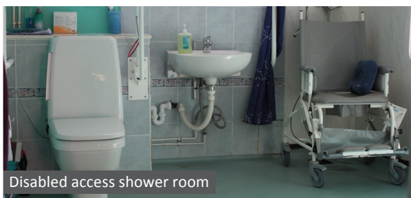
Disabled access shower room