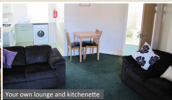
Your own lounge and kitchenette