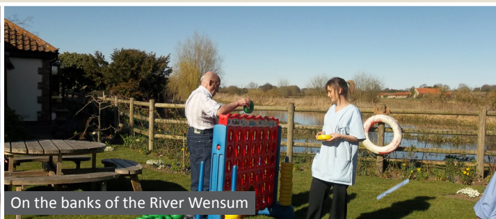
On the banks of the River Wensum