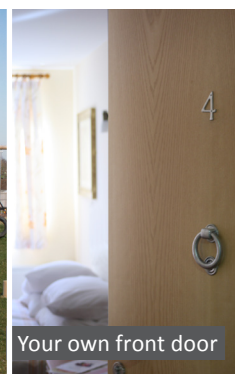
Your own front door