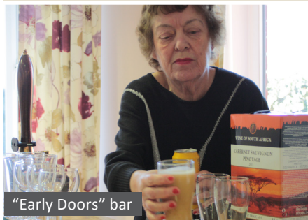
"Early Doors" bar