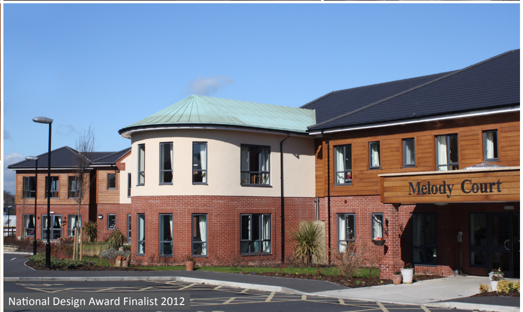
National Design Award Finalist 2012