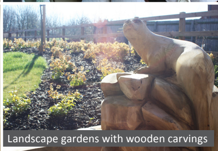
Landscape gardens with wooden carvings