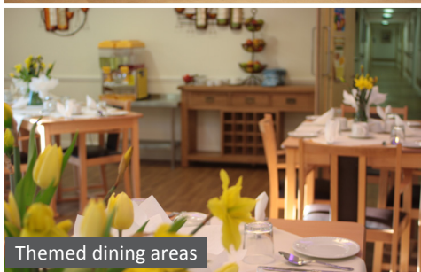
Themed dining areas