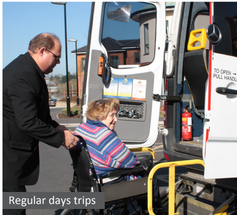
Regular days trips