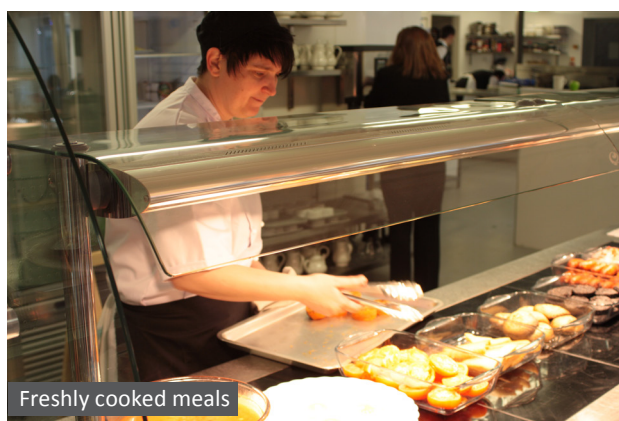
Freshly cooked meals