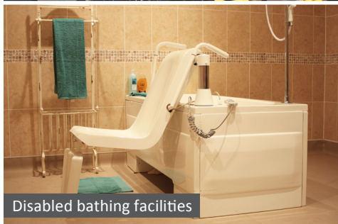
Disabled bathing facilities