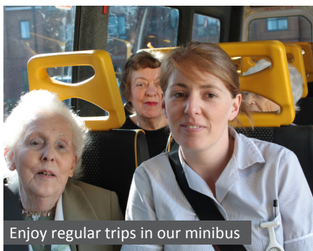
Enjoy regular trips in our minibuss