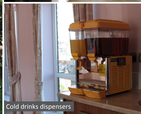
Cold drinks dispensers