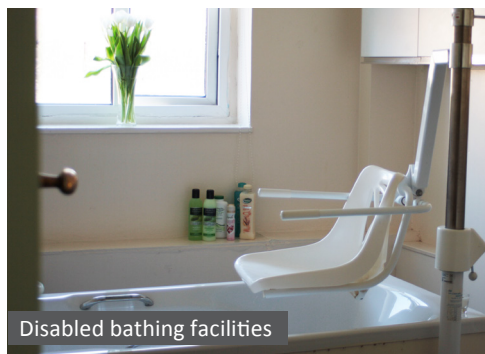
Disabled bathing facilities

Old Rectory is a 40 bed care home for clients whose needs are associated with old age, their mental health and physical disabilities. The home also offers a highly specialised dementia care service.