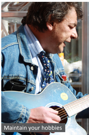
Maintain your hobbies