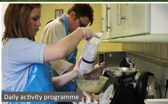
Daily activity programme