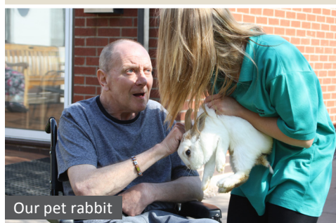
Our pet rabbit